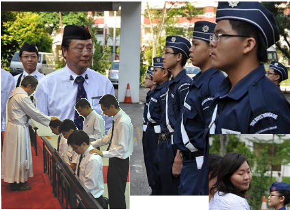
BB Enrolment on 11 th April